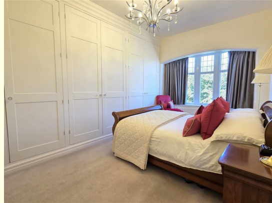
BEDROOM TWO 16'9 into bay x 8'9 plus wardrobes

Second good sized fitted double bedroom. UPVC double glazed bay window overlooks the front of the property. Upper obscure leaded lights. Side and two top opening lights. Curved double panel radiator below. Picture rails. Television aerial point. Bank of three fitted double wardrobes with storage above.