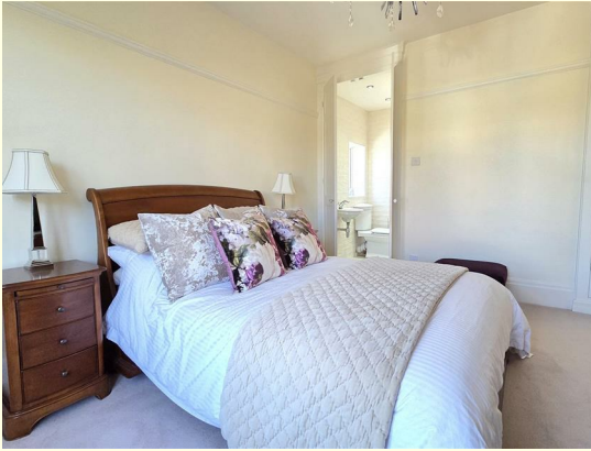
EN SUITE SHOWER/WC 8'5 into shower x 4'10