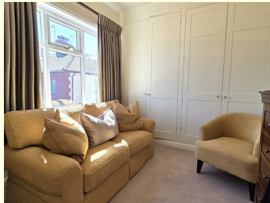
BEDROOM THREE 9' x 8'8

Third bedroom currently furnished as a 1st floor sitting room. UPVC double glazed window to the rear elevation with a central top opening light. Picture rails. Period style radiator. Two large built in wardrobes, one houses the Baxi combi gas central heating boiler.